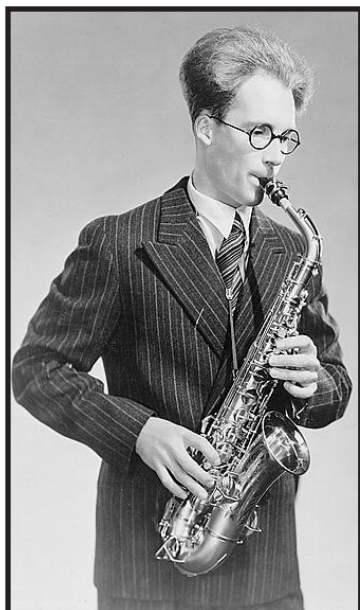
Portrait of Sigurd Raschèr