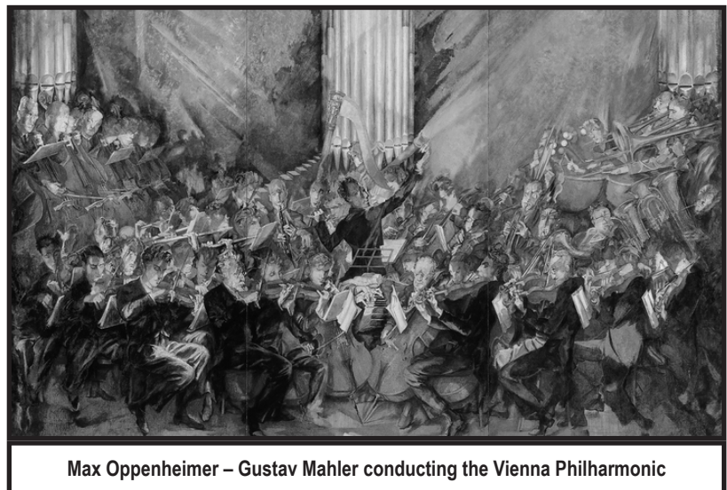
Max Oppenheimer – Gustav Mahler conducting the Vienna Philharmonic

The symphony's opening movement begins not with a theme, but with sounds of nature. The note A wafts eerily, spanning seven octaves from the lowest to the highest strings. It may capture memories from Mahler's childhood, from the forest near his parent's house in Iglau. There the boy often sat on a log daydreaming and perhaps escaping an unhappy home. "I've been to that wood, and I've sat there," reports Lebrecht. "The [sustained A is the] first sound that I heard — when the wind changes, when it starts blowing in from the east and you know the rain is coming..." More aural fragments build